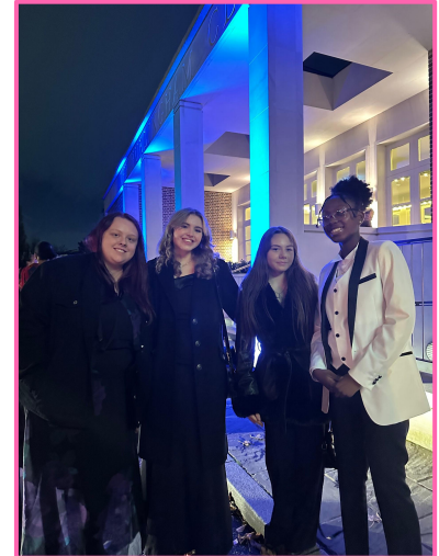
Group photo of the young people attending the nomination.