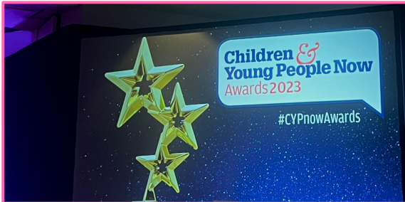
Board saying "Children & Young People Now Awards 2023"

This was after their motion in March 2023, asking for a protected characteristic for Care Experience .