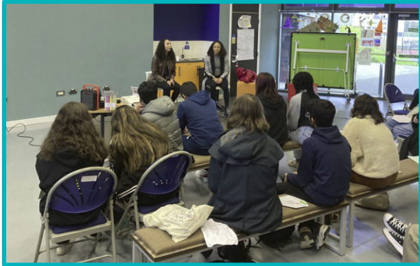
A photo taken at the towards the end of the YouthForia, where young people across the North West sat and listened to a presentation.

On Saturday the 29th of October, Youth Councillors went to YouthForia , held in Huyton (Knowsley, Merseyside), more on what YouthForia is on the previous slide.