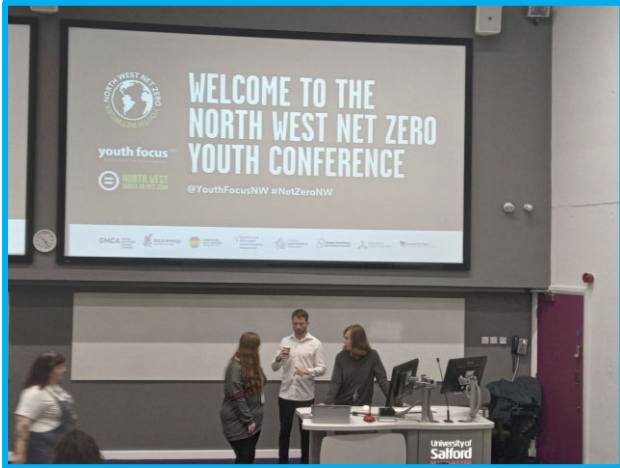
A photo taken at the conference, with a projector projecting "Welcome to the North West Net Zero Youth Conference"

In October 2022, a member of OYC attended the North West Net Zero conference in Salford, learning about ideas such as how we can grow plants on buildings , which can reduce flooding, reduce CO 2 emissions and help regulating building temperature.