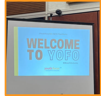
Above: the words "Welcome to YoFo" projected on a screen.

We worked on our debating skills around the dependency on plastic & making a plantable pledge on how to make our personal lives more environmentally effective. We ended the conference by electing members to the YouthForia Steering Group.