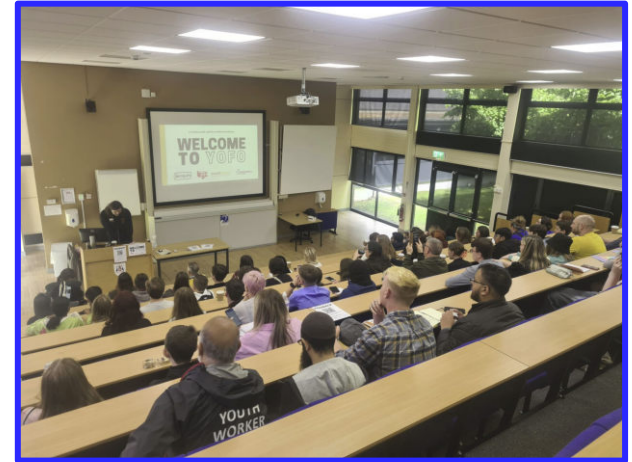
A photo taken at the start of the YouthForia, with a projector projecting "Welcome to YoFo"

This YouthForia was held at Liverpool Hope University , and was themed on Health and Wellbeing , where we learned about period poverty and the issues in the system when transitioning from a child to an adult. We additionally learned skills such as campaigning skills and how to hold a focus group.