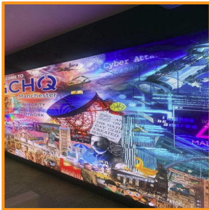
Large screen saying "Welcome to GCHQ Manchester" with a collated image, containing images of Manchester landmarks, significant people and stuff associated with GCHQ, e.g. computer screens.

We learned about and talked about super ("zooper") jobs.