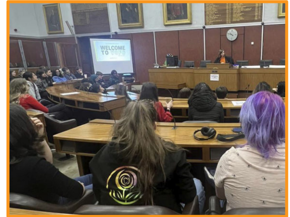
An image taken at the December 2022 YouthForia, where young people were seated in the Oldham Council Chambers and the words "Welcome to YoFo" was projected on a screen to the side.