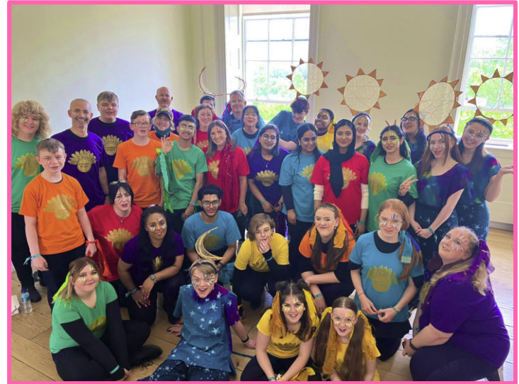
Youth Councillors, Youth Workers and residents of Oldham in a group picture in their costumes, worn at the pageant.