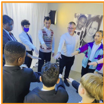
Young people running and participating within the theatre workshop.

Our theatre workshop programme, You Stand Accused , was a campaign with Oldham Theatre Workshop, where students from some Oldham secondary schools came to watch performances on bullying.